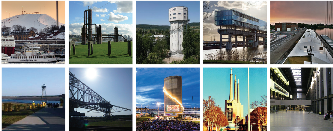
Work in the landscape full - empty

The main challenge for adaptive reuse projects of these structures is finding a way how to design an adaptation to a new function (mostly based on a human scale) for a construction with inhuman characteristics . In the process, it is necessary to emphasise historical and social value of the building / structure, its architectural and industrial legacy , while performing the project at a reasonable cost and in accordance with the concept of sustainability and respect for the environment .